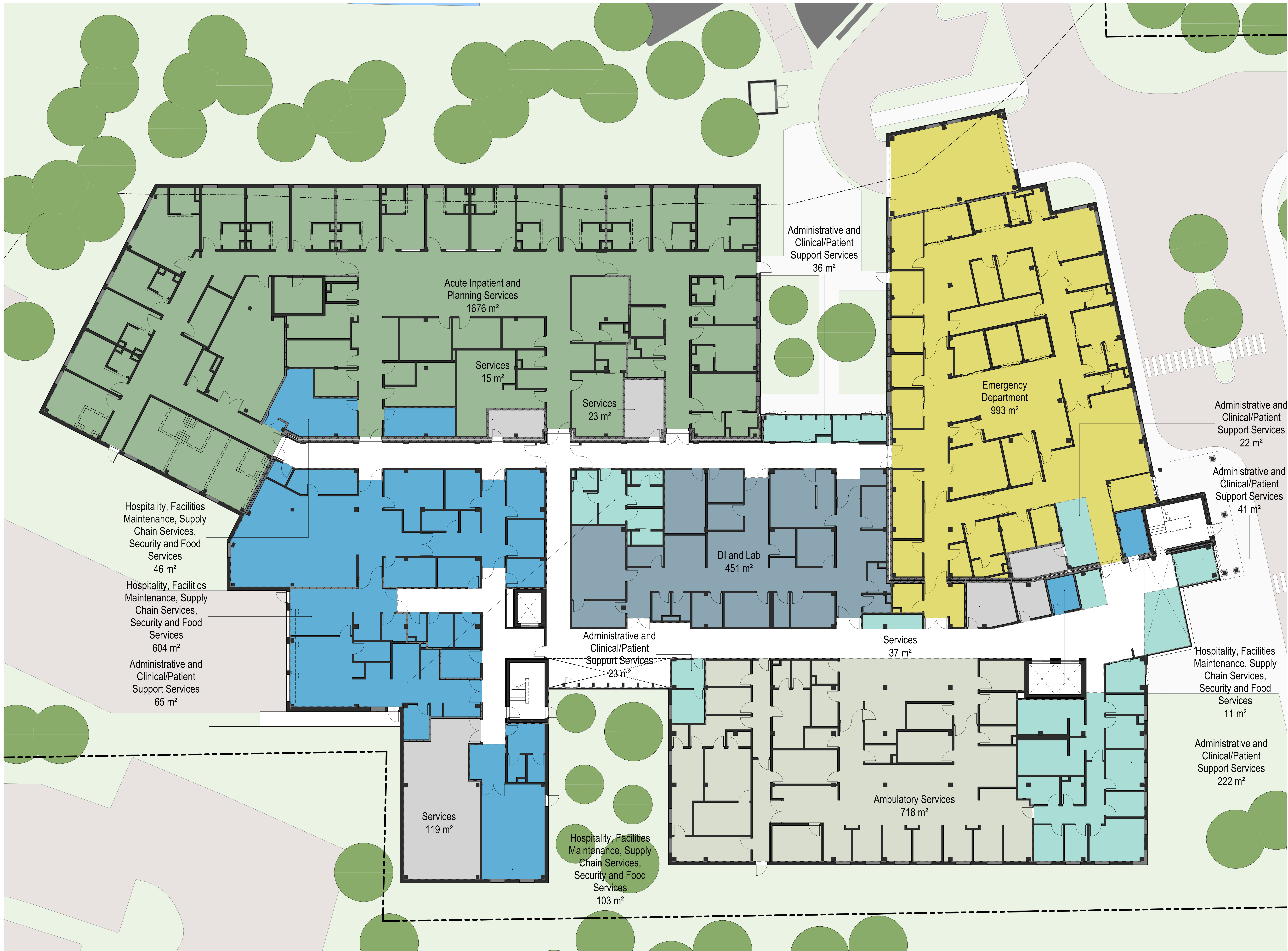
FLOOR PLAN - LEVEL 1 - DEPARTMENTS

Project Status MOHLTC STAGE 4 SUBMISSION